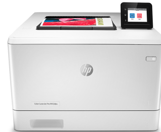
HP Color LaserJet Pro M454dw

Dynamic security enabled printer. Only intended to be used with cartridges using an HP original chip. Cartridges using a non-HP chip may not work, and those that work today may not work in the future. Learn more at: http://www.hp.com/go/learnaboutsupplies