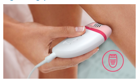
The rounded shape fits perfectly in your hand for comfortable hair removal. It looks great too!