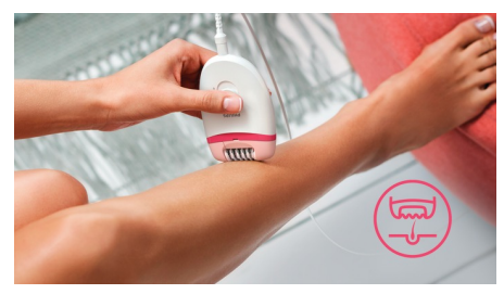
Efficient epilation system leaves your skin smooth and stubble free for weeks