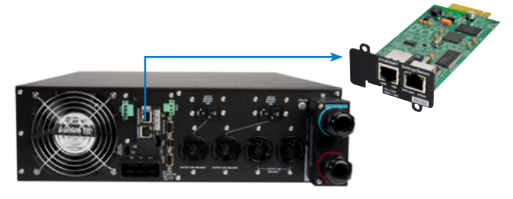
The bundled Network Card-MS allows the 9PX to connect to an Ethernet network and the Internet, supporting real-time monitoring and control of UPSs across the network via a standard Web browser, SNMP-compliant network management system or power management software.