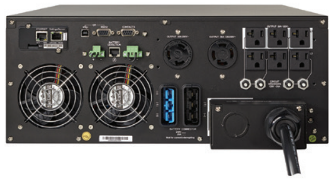
Split-phase models incorporate flexible receptacle configurations that natively offer both 208 and 120 volt. Rear panel of 9PX 6K split-phase shown above.