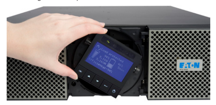
The 9PX displays key data such as its up to 93 percent efficiency rating, alarm history, runtime remaining, load percentage and more in a graphical format.

With an LCD interface that tilts 45 degrees for optimal viewing, rotates to match rack and tower installations, and provides clear information on UPS status and measurements, the 9PX makes local management easy.