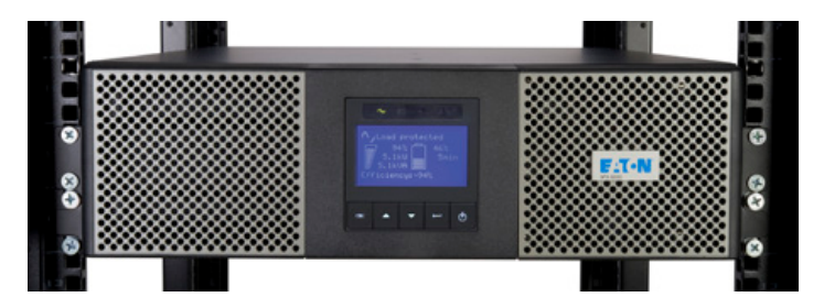
Each 9PX includes a 4-post rail kit.

The 9PX has the versatility to meet the demands of a wide array of IT applications.