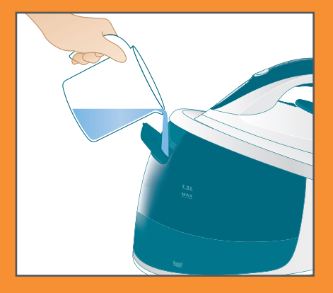
Fill the water tank halfway and switch on the appliance.