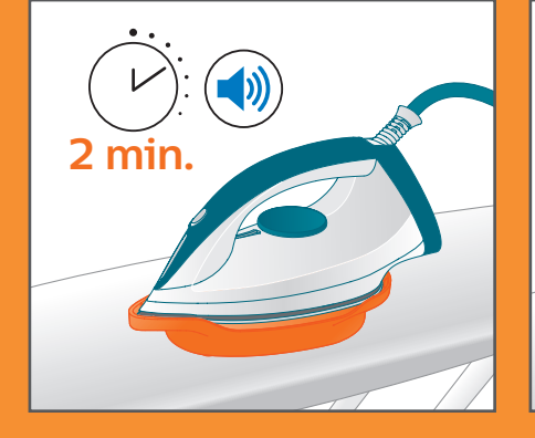
Wait approximately 2 minutes . You will hear short beeps.