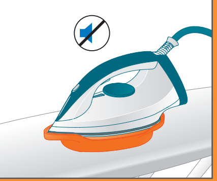
When the descaling process is completed, the iron stops beeping.