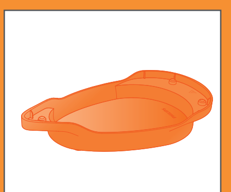
With the Calc-Clean container provided, you can perform descaling easily and get clean steam.

The steam function will be disabled automatically if descaling is not performed.