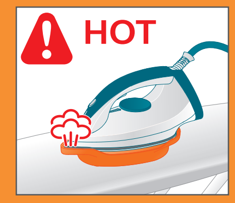
Wait approximately 5 minutes before emptying the Calc-Clean container.