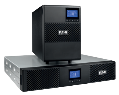
9SX Rack & Tower models