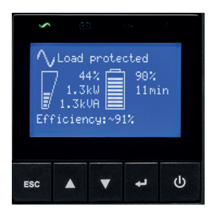
9SX graphical LCD