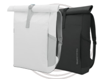
Lenovo IdeaPad Gaming Modern Backpack