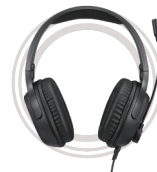
Lenovo IdeaPad Gaming H100 Headset