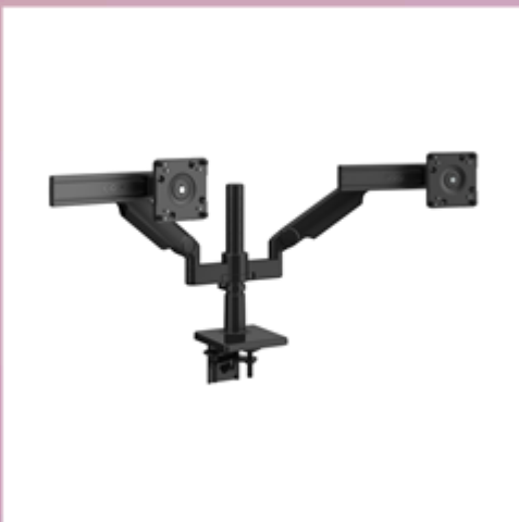
Humanscale Dual Monitor Arm Black 4ZE1U10766