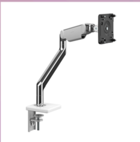
Humanscale Single Monitor Arm White 4ZE1U10765

Please click here to view the full list of accessories.