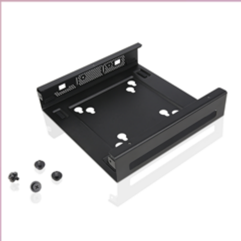
ThinkCentre Tiny VESA Mount II 4XFON03161