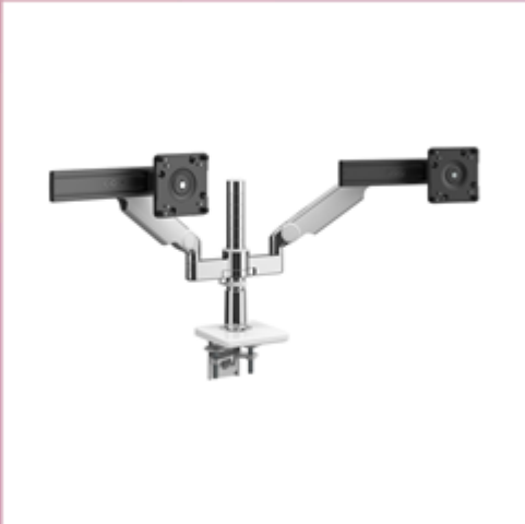
Humanscale Dual Monitor Arm White 4ZE1U10767

Lenovo may not offer the products, services or features discussed in this document in all regions. Lenovo may withdraw an offering at any time. Consult your local representative for information on offerings available in your area. Lenovo reserves the right to change specifications or other product information without notice. Lenovo is not responsible for photographic or typographical errors. Lenovo provides this publication “as is” without warranty of any kind, either express or implied, including the implied warranties of merchantability or fitness for a particular purpose.