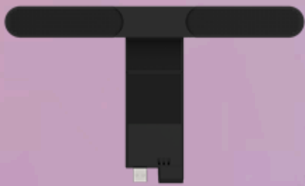
ThinkVision MS30 Monitor Soundbar 4XD1J05151

Please click here to view the full list of accessories.