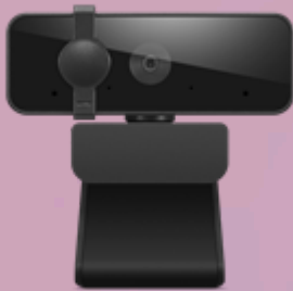
Lenovo Essential FHD Webcam Gen2 4XC1S15018