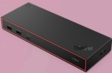
ThinkPad USB4 Dock 5000 40BF0100IN

Lenovo may not offer the products, services or features discussed in this document in all regions. Lenovo may withdraw an offering at any time. Information is subject to change without notice. Consult your local representative for information on offerings available in your area. Lenovo reserves the right to change specifications or other product information without notice. Lenovo is not responsible for photographic or typographical errors. Lenovo provides this publication "as is" without warranty of any kind, either express or implied, including the implied warranties of merchantability or fitness for a particular purpose.