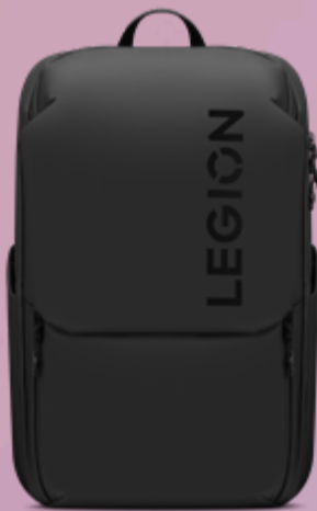
Lenovo Legion 17" Gaming Backpack GB800 (Black) GX41U39299

Please click here to view the full list of accessories.