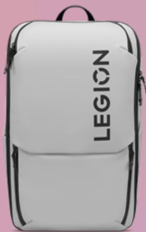
Lenovo Legion 17" Gaming Backpack GB800 (Light Gray) GX41U39300

Lenovo may not offer the products, services or features discussed in this document in all regions. Lenovo may withdraw an offering at any time. Information is subject to change without notice. Consult your local representative for information on offerings available in your area. Lenovo reserves the right to change specifications or other product information without notice. Lenovo is not responsible for photographic or typographical errors. Lenovo provides this publication "as is" without warranty of any kind, either express or implied, including the implied warranties of merchantability or fitness for a particular purpose.