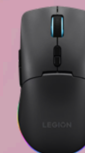
Lenovo Legion M220 Wireless RGB Gaming Mouse GY51U28359