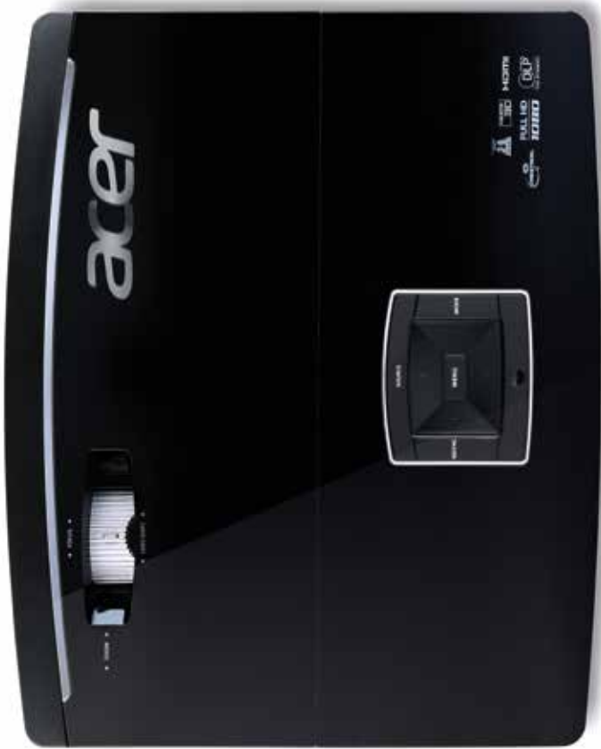
Vertical Lens Shift and 1.36x or 1.6x zoom

The Acer P6 projectors come with a number of features that make them environmentally friendly. Acer EcoProjection dramatically reduces standby power, while Acer ExtremeEco lowers lamp consumption by up to 80% and extends the lifespan of the lamp by up to 4,500 hours, keeping costs under control and ensuring long-term, dependable projector use.