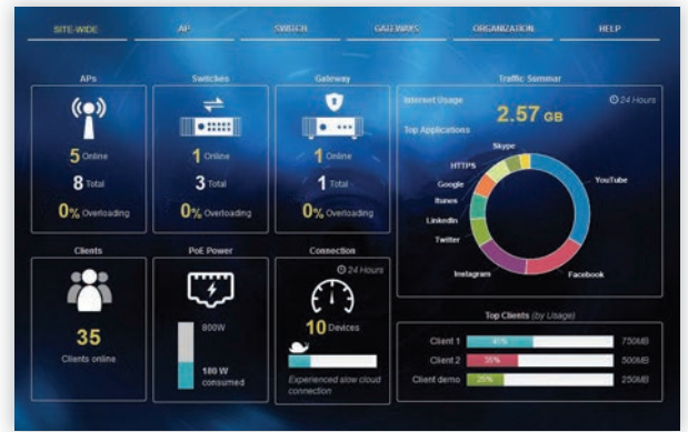
Real-time control of all the devices through a single pane of glass