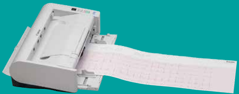
Long Paper Scanning