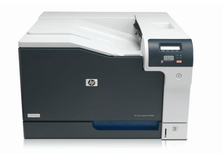
HP Color LaserJet Professional CP5225dn Printer As base model plus built-in Fast Ethernet 10/100 • As base model plus automatic two-sided printing and built-in Fast Ethernet 10/100 Base-T networking

HP Color LaserJet Professional CP5225n Printer • Base-T networking