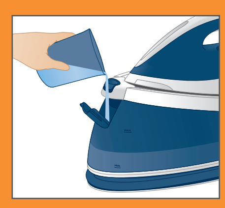
Fill the water tank halfway and switch on the appliance.