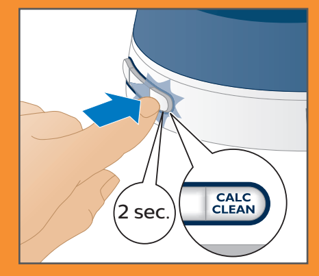
Press and hold the 'CALC-CLEAN' button for 2 seconds until you hear short beeps.