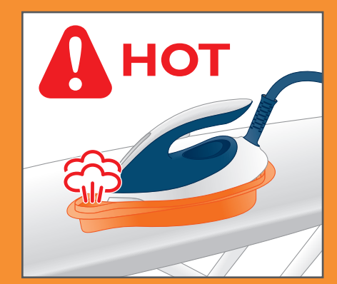
Wait approximately 5 minutes before emptying the Calc-Clean container.