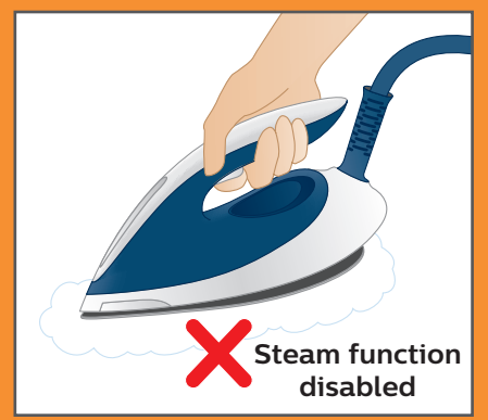
The steam function will be disabled automatically if descaling is not performed.