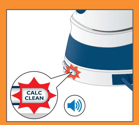
Perform descaling once the descaling light flashes and the appliance beeps.

With the new Smart Calc-Clean feature, you'll be reminded to descale your appliance when this is needed.