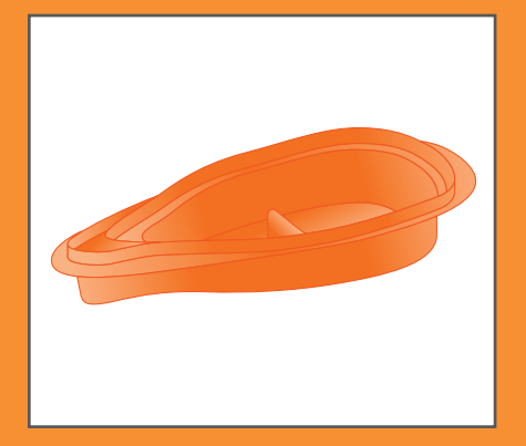
With the Calc-Clean container provided, you can perform descaling easily and get clean steam.