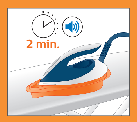
Wait approximately 2 minutes. You will hear short beeps.