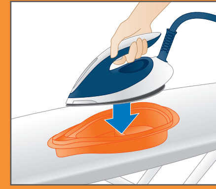
Place the iron on the Calc-Clean container on an even, stable surface.