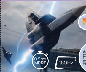
With AMD FreeSync™ Premium Technology 3