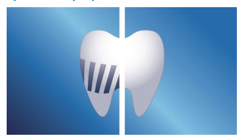
AirFloss Pro/Ultra removes up to 99.9% of plaque from treated areas.***