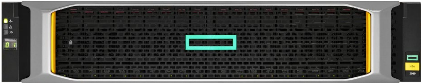
HPE MSA 2060 Storage

The HPE MSA 2060 is a flash-ready hybrid storage system designed to deliver hands-free, affordable application acceleration for small and remote office deployments. Don't let the low cost fool you. It gives you the combination of simplicity, flexibility, and advanced features you may not expect in an entry-priced array. Start small and scale as needed with any combination of solid state drives (SSDs), high-performance Enterprise SAS HDDs, or lower-cost Midline SAS HDDs. With the ability to deliver 325,000 IOPS, the new MSA 2060 is up to 45% faster than its prior generation with ample horsepower for even the most demanding workloads.