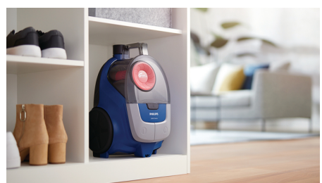
Compact and lightweight design ensure both storing and carrying the vacuum is easy.