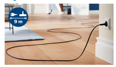
9-meter reach from plug to nozzle allows longer use without unplugging.