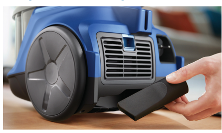
Crevice tool is integrated into the vacuum so it's easily accessible to use any time you need.