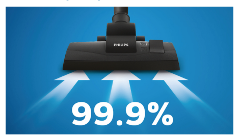
Multi-purpose nozzle and high suction power ensure you can vacuum 99.9% of fine dust*.