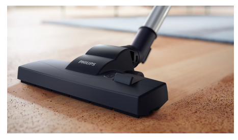
Multi-purpose nozzle can be easily adjusted using the foot pedal, for optimal use on hard floors or carpets.