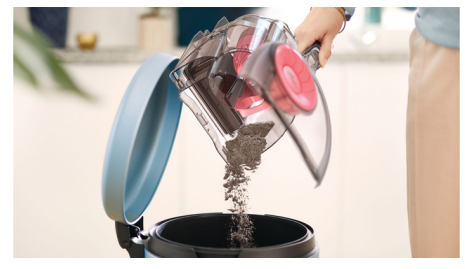
Easy-to-empty dust container is designed for hygienic disposal with one hand, to help minimize dust cloud.