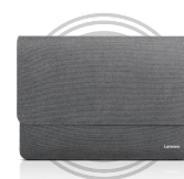
Lenovo Ultra Slim Sleeve