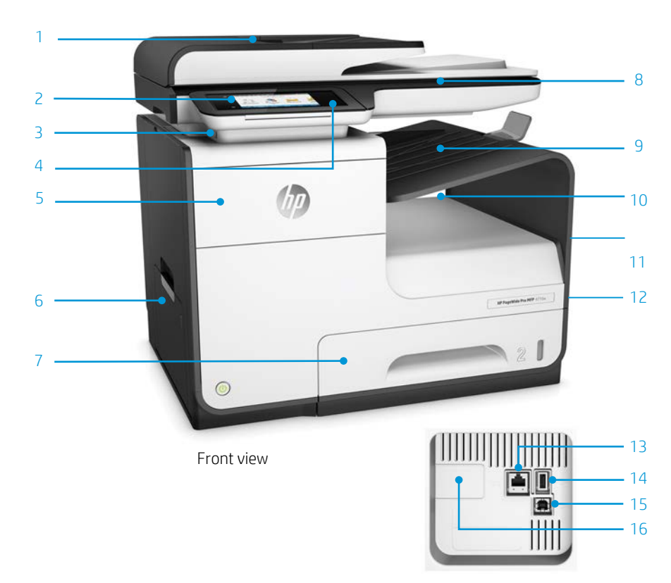
Rear I/O panel close-up