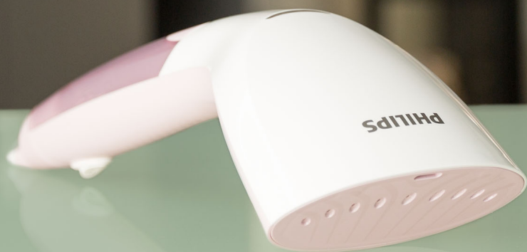
Philips Handheld garment steamer

1000W, up to 20 g/min Vertical Steaming 60ml non detachable water tank