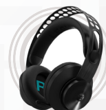
Lenovo Legion H300 Stereo Gaming Headset