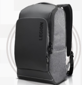
Lenovo Legion 15.6" Recon Gaming Backpack

* Example of Lenovo catalogue naming convention