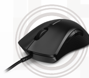
Lenovo Legion M300 RGB Gaming Mouse