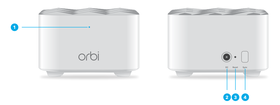
Figure 2. Orbi satellite front and back views

The following figures shows the Orbi satellite hardware features.