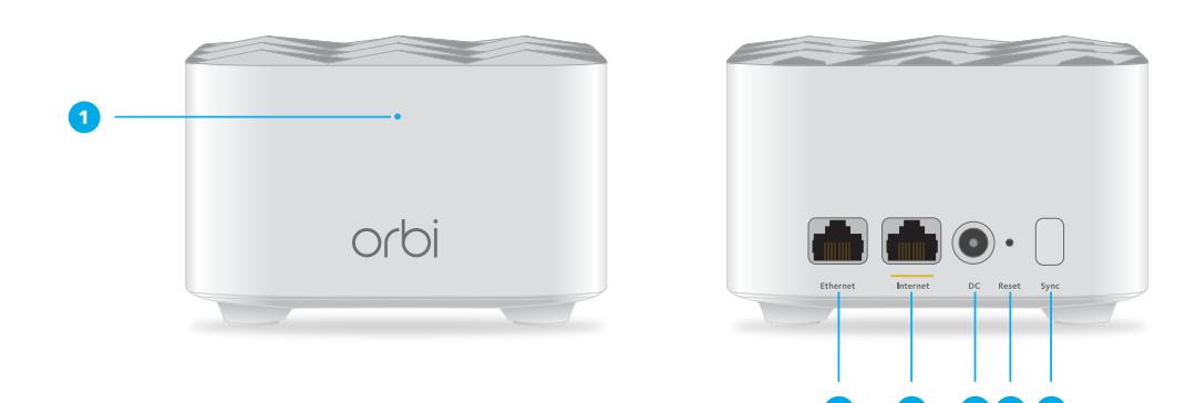
Figure 1. Orbi router front and back views

The following figures shows the Orbi router hardware features.