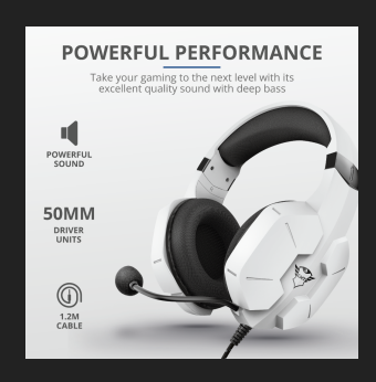
PRODUCT PICTORIAL 1