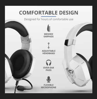
PRODUCT PICTORIAL 3