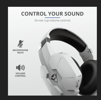
PRODUCT PICTORIAL 4