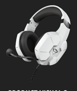
PRODUCT VISUAL 3