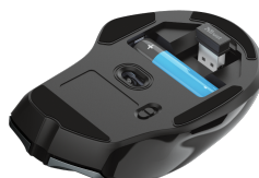
PRODUCT BOTTOM 1