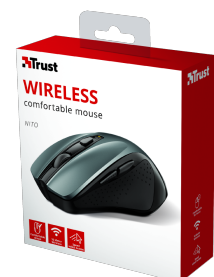
PACKAGE VISUAL 1