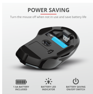
PRODUCT PICTORIAL 3