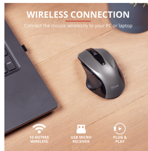
PRODUCT PICTORIAL 1