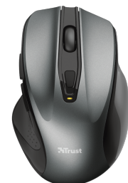
PRODUCT TOP 1