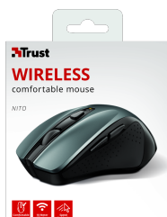
PACKAGE FRONT 1