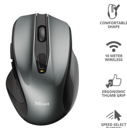
PRODUCT ESHOT 1