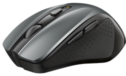
PRODUCT VISUAL 1