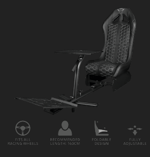
PRODUCT ESHOT 1