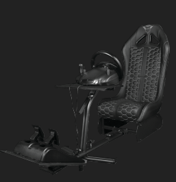
PRODUCT VISUAL 2