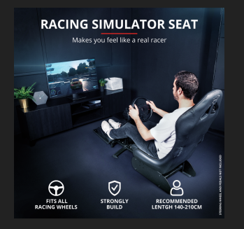
PRODUCT PICTORIAL 1