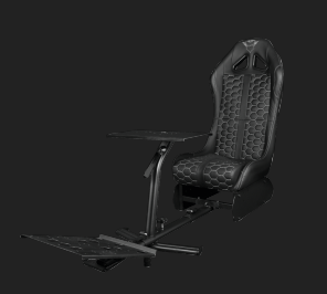
PRODUCT VISUAL 1