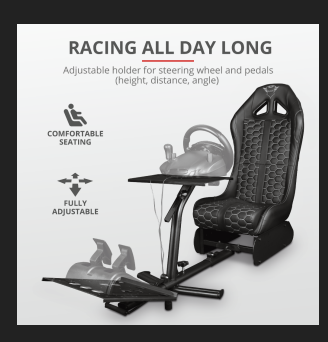
PRODUCT PICTORIAL 2