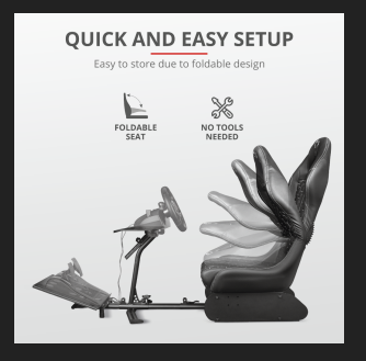
PRODUCT PICTORIAL 3