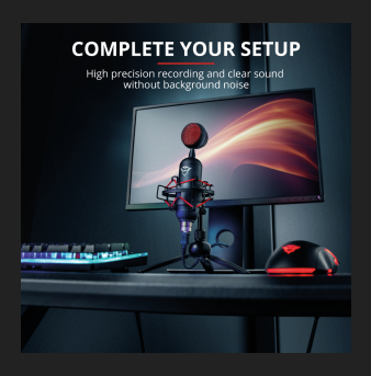
PRODUCT PICTORIAL 3