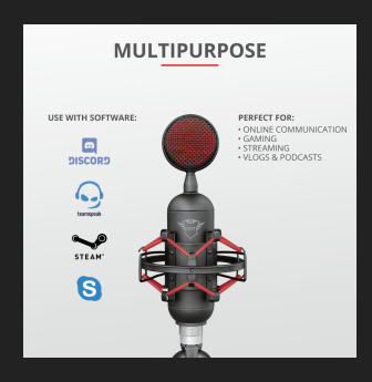
PRODUCT PICTORIAL 4