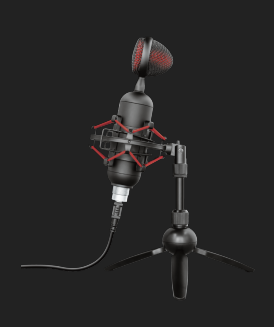
PRODUCT SIDE 1