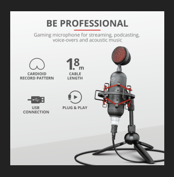
PRODUCT PICTORIAL 1