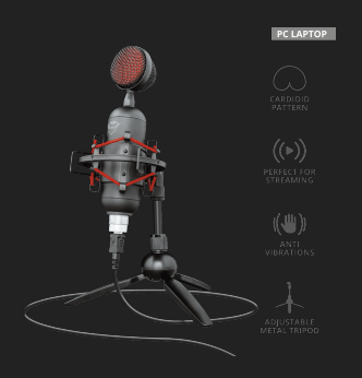
PRODUCT ESHOT 1