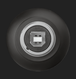
PRODUCT BOTTOM 1

High resolution images: www.trust.com/23466/materials