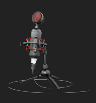
PRODUCT VISUAL 1