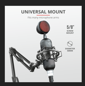
PRODUCT PICTORIAL 5