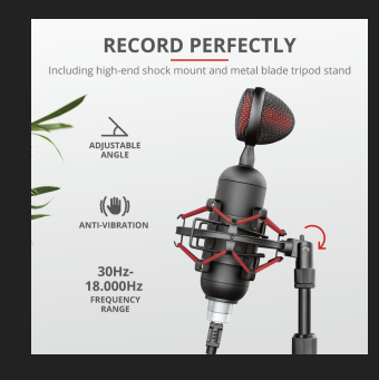
PRODUCT PICTORIAL 2