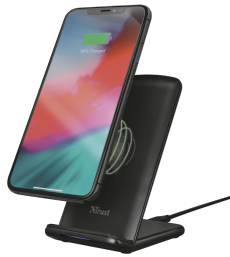
PRODUCT VISUAL 1