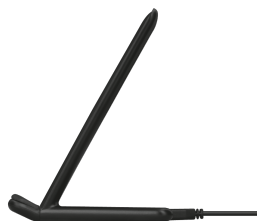
PRODUCT SIDE 1