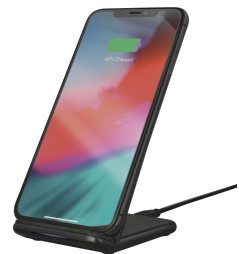
PRODUCT VISUAL 3