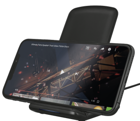
PRODUCT VISUAL 4