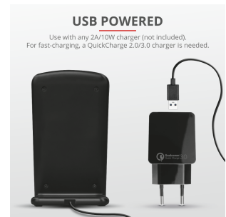
PRODUCT PICTORIAL 5