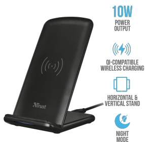
PRODUCT ESHOT 1