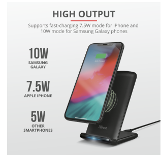
PRODUCT PICTORIAL 2