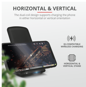
PRODUCT PICTORIAL 3