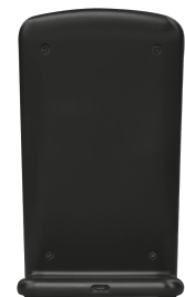
PRODUCT BACK 1