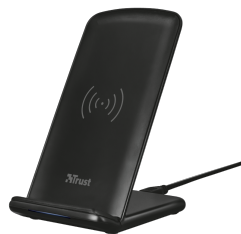
PRODUCT VISUAL 2