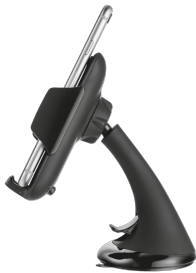
PRODUCT SIDE 1