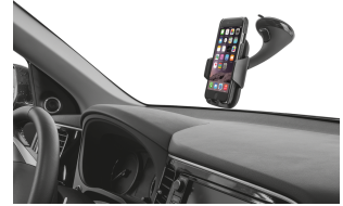
PRODUCT EXTRA 1