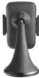
PRODUCT BACK 1