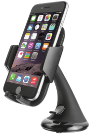
PRODUCT VISUAL 1