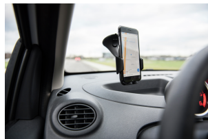
LIFESTYLE VISUAL 1