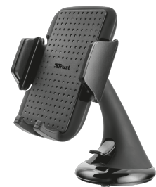
PRODUCT VISUAL 2