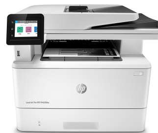
HP LaserJet Pro MFP M428fdw

Dynamic security enabled printer. Only intended to be used with cartridges using an HP original chip. Cartridges using a non-HP chip may not work, and those that work today may not work in the future. Learn more at: http://www.hp.com/go/learnaboutsupplies