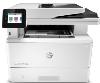
HP LaserJet Pro MFP M428fdn

Winning in business means working smarter. The HP LaserJet Pro MFP M428 is designed to let you focus your time where it's most effective – growing your business and staying ahead of the competition.