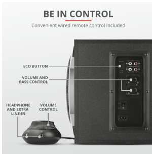
PRODUCT PICTORIAL 3