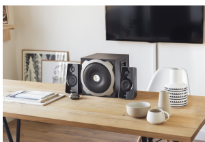
LIFESTYLE VISUAL 1