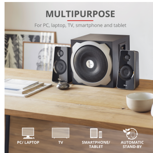
PRODUCT PICTORIAL 4