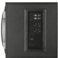
PRODUCT SIDE 1