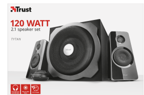
PACKAGE FRONT 1