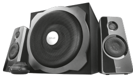
PRODUCT VISUAL 1