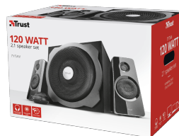
PACKAGE VISUAL 1