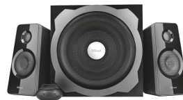
PRODUCT FRONT 1