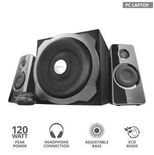
PRODUCT ESHOT 1