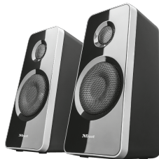
PRODUCT EXTRA 1