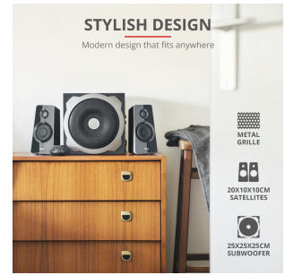
PRODUCT PICTORIAL 2