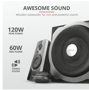
PRODUCT PICTORIAL 1