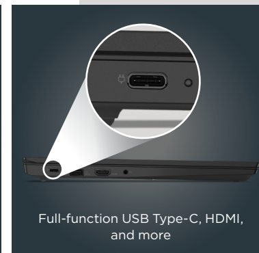
Full-function USB Type-C, HDMI, and more