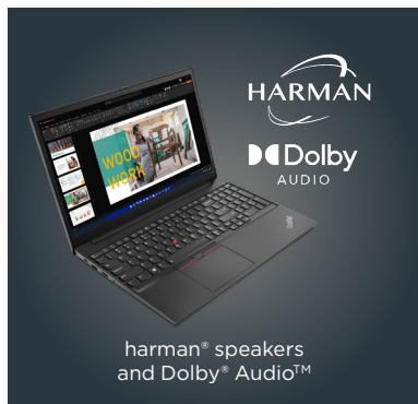
harman® speakers and Dolby® Audio™

Enjoy instant and secure logins with facial recognition using the FHD Hybrid IR camera, or with the FPR integrated 3 on the power button. Maintain webcam privacy by simply sliding the camera privacy shutter cover when not in use.