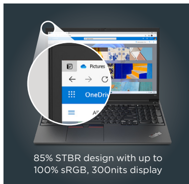
85% STBR design with up to 100% sRGB, 300nits display