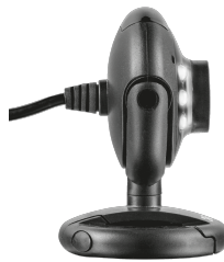
PRODUCT SIDE 1