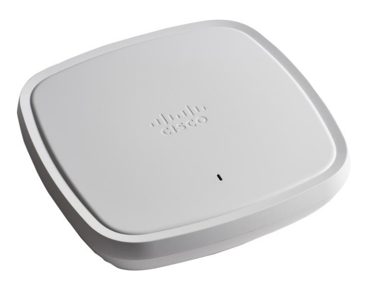
The Cisco<sup>®</sup> Catalyst<sup>®</sup> 9115 Series Wi-Fi 6 Access Points are the next generation of enterprise access points. They are resilient, secure, and intelligent.

Hyperconnectivity with steady performance in demanding environments. Exponential growth of Internet of Things (IoT) devices and next-generation applications. Advanced persistent security threats. All of these require a wireless network that provides resiliency and superior connectivity, integrated security with advanced classification and containment, and hardware and software innovations to automate, secure, and simplify networks. Updating your wireless infrastructure to one that will meet these needs is paramount for today's digital business. The new generation of Cisco Catalyst 9100 Access Points, with high-performance Wi-Fi 6 (802.11ax) capabilities and innovations in RF performance, security, and analytics, enables end-to-end digitization and helps accelerate the rollout of business services by delivering beyond Wi-Fi.