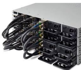
Figure 4. Cisco Catalyst 9200 Series switch stacked units