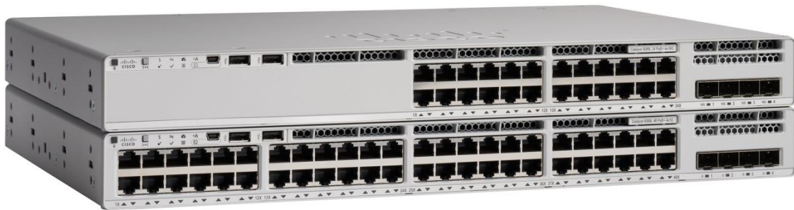
Table 1. Cisco Catalyst 9200 Series Switch configurations