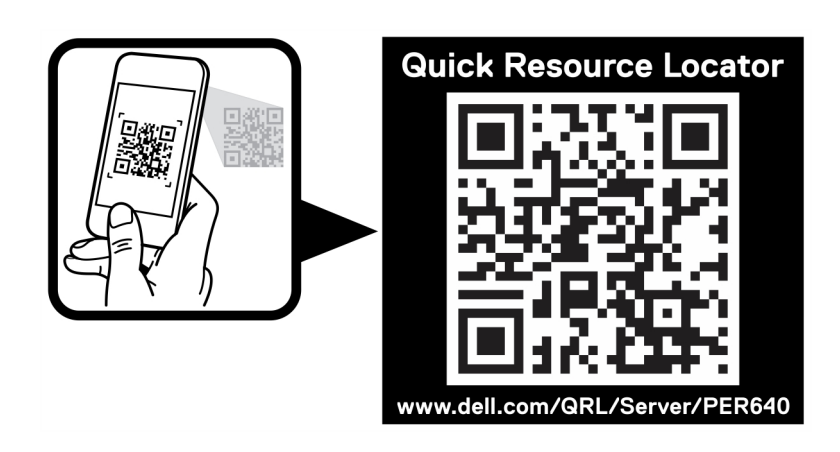
Figure 2. Quick Resource Locator for PowerEdge R640