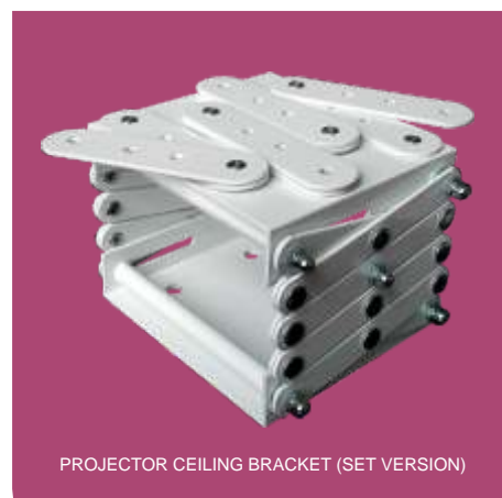
PROJECTOR CEILING BRACKET (SET VERSION)