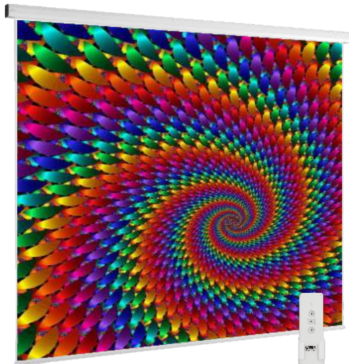
BASIC EQUIPMENT: RF TRANSMITTER