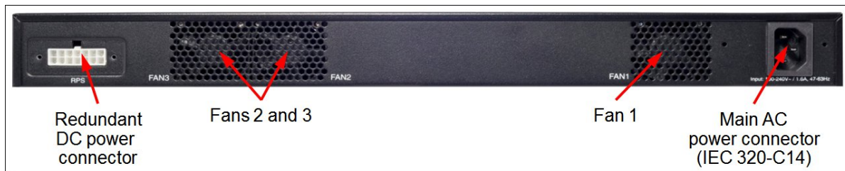
Figure 4. Rear panel of the RackSwitch G7028

The rear panel of the RackSwitch G7028 is shown in the following figure.