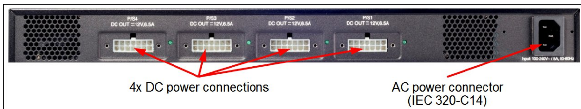
Figure 5. Rear panel of the RackSwitch G7000 RPS option

The rear panel of the RackSwitch G7000 RPS option is shown in the following figure.