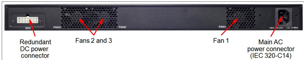
Figure 4. Rear panel of the RackSwitch G7052

The rear panel of the RackSwitch G7052 is shown in the following figure.