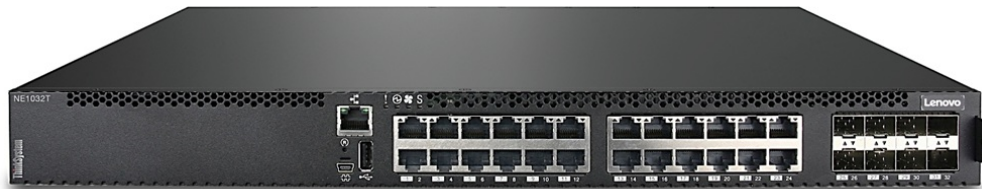
Figure 1. Lenovo ThinkSystem NE1032T RackSwitch

The Lenovo ThinkSystem NE1032T RackSwitch is shown in the following figure.