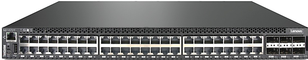
Figure 1. Lenovo ThinkSystem NE1072T RackSwitch

The Lenovo ThinkSystem NE1072T RackSwitch is shown in the following figure.