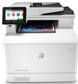
HP Color LaserJet Pro M479dw

Winning in business means working smarter. The HP Color LaserJet Pro MFP M479 is designed to let you focus your time where it's most effective—growing your business and staying ahead of the competition.