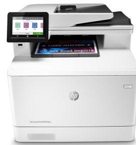
HP Color LaserJet Pro M479fnw

Dynamic security enabled printer. Only intended to be used with cartridges using an HP original chip. Cartridges using a non-HP chip may not work, and those that work today may not work in the future. Learn more at: http://www.hp.com/go/learnaboutsupplies