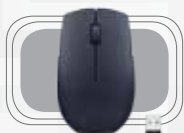
Lenovo 520 Wireless Mouse