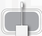
Lenovo USB-C 3-in-1 Hub