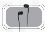
Lenovo 100 In-Ear Headphone

* Example of Lenovo catalogue naming convention