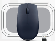
Lenovo 520 Wireless Mouse