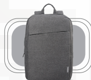
Lenovo 15.6" Laptop Casual Backpack B210